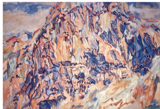
Positano #1 , 1960, Oil on canvas, 64 x 90 in.

Philip Pearlstein is synonymous with figure painting - particularly nude figures, often surrounded by objects from Pearlstein's vast collection of art and americana that is housed within the artist's New York City Studio. However as much as he is a voracious collector, he is also an avid traveler. Throughout his nearly 75 year career, Pearlstein has also painted many famous landscapes from direct observation. Over the years these landscapes have been paid much less attention by critics, even though Pearlstein approaches these works in the very same way he approaches his acclaimed figures. Pearlstein has explained: "I see the figure as landscape; the landscape as figure – they're the same!" In this exhibition, figures and landscapes are juxtaposed, underscoring Pearlstein's commitment to painting exactly what is in front of him, precisely what his eyes see, without an ounce of narrative or idealization.