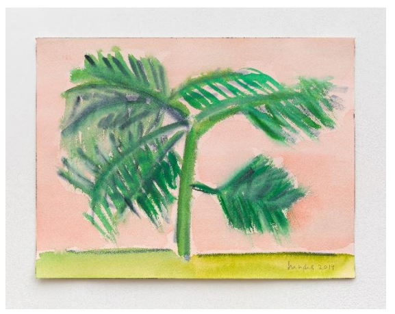
Green Tree – Pink Sky I, 2019 Watercolor on canvas, 12 1/8 x 16 1/8 in.

In Elsewhere , Enders paints her way through imaginary travels in time as well as in place. Enders keeps an on-going diary - a stream of consciousness in the form of notations and those notations become the basic seed for her paintings. In this exhibition, her mind travels from the Battle of Lepanto (1571) with guns firing, to the quiet hills of France, to the frantic palms blown by hurricane winds, then on to the Great Wall of China and finally on to the quiet seas of Nova Scotia. The exhibition features 10 paintings and 20 works on paper, all completed 2018-19.