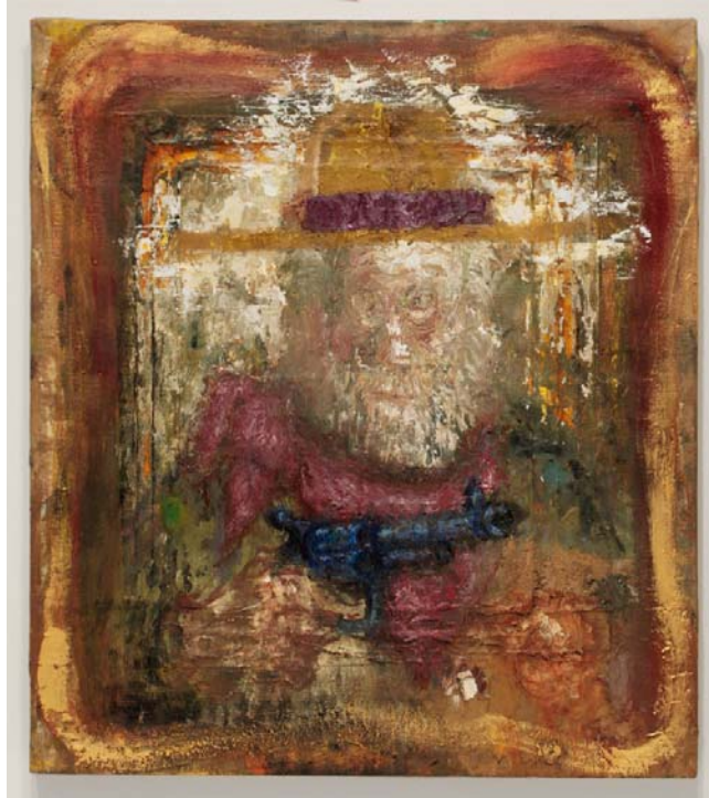
OLD BUCKAROO 2011 Oil on canvas 34 x 30 inches