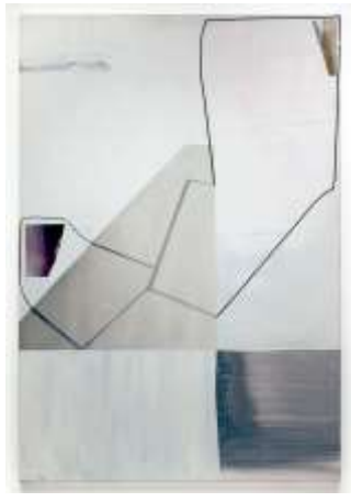
Gordon Moore , Looped , 2011, Oil, pumice and latex on canvas, 82 <sup>3</sup>/<sub>4</sub> x

January 10– February 16, 2013 Opening Reception: Thursday, January 10<sup>th</sup> 6 – 8 PM