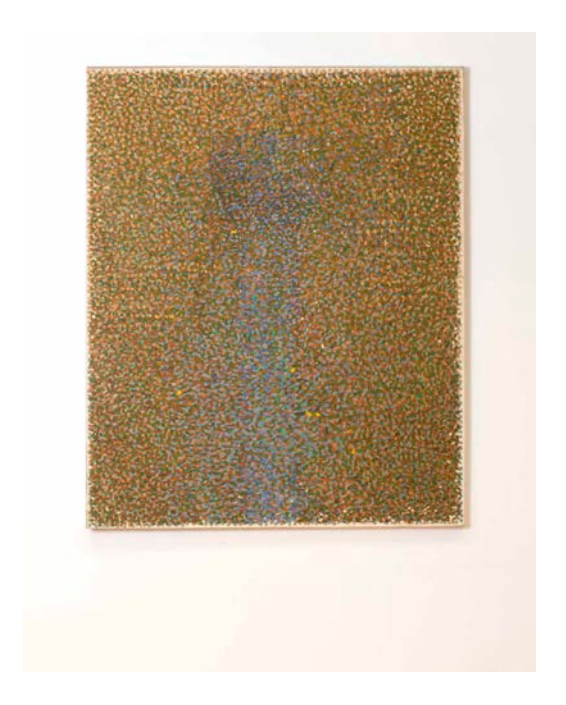
Andrew Forge, "Monreale" (1985-86), oil on canvas, 44 x 36 inches

These paintings are records of thousands and thousands of decisions, all of which feel as if they are visible. He seemed to proceed purely on his nerve. One can see relationships between the colors and/or tones, but Forge often added a series of unconnected lines or dispersed dots in no apparent pattern to interrupt any visual rhythm that might occur in his paintings. The balance between rhythm and dissonance is always tightly calibrated. We don't look at these paintings; we look into them, while being conscious of the surface.