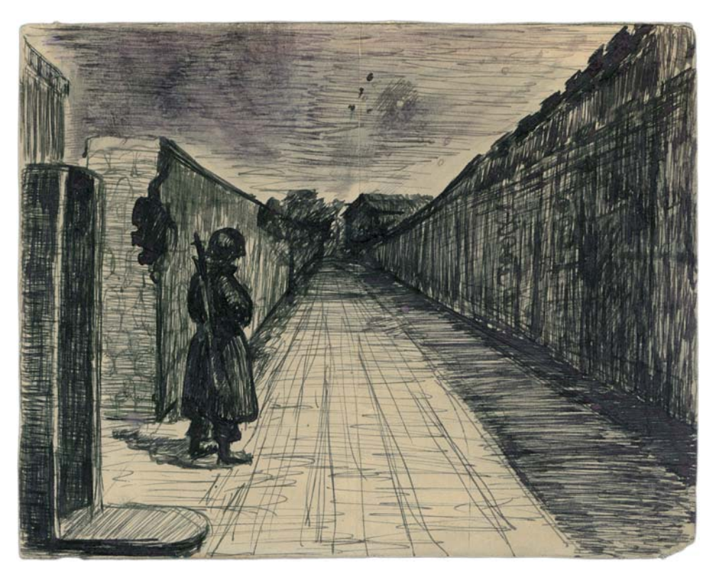
Philip Pearlstein, Rome, Italy XII , 1944, Pen and ink on paper, 4 13/16 x 6 1/16 in. The Morgan Library & Museum. © Philip Pearlstein.

Among the works coming to the Morgan are a number of items undertaken for the army visualaids shop, including a deck of silkscreened flashcards of map symbols. The majority of the collection involves drawings done by Pearlstein during more casual moments, recording the reality of life as a G.I. in basic training, the crossing of the Atlantic in a ship convoy, and landscapes and civilians the artist encountered in his travels.