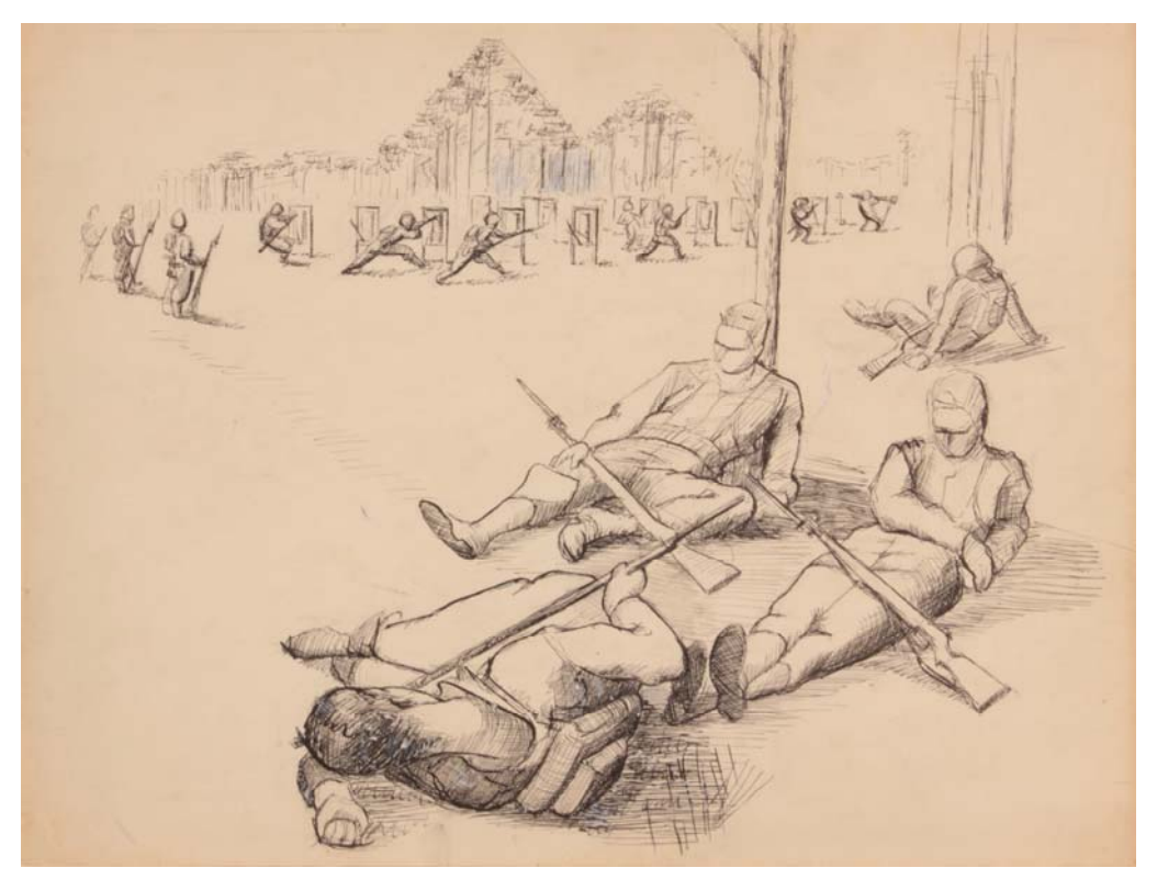
Philip Pearlstein, Soldiers Resting (study for bayonet practice), 1943, Pen and ink on paper, 10 5/8 x 13 9/10 in. The Morgan Library & Museum. © Philip Pearlstein.

This unusual and surprising cache of works by the celebrated artist—better known today for his depictions of nudes in the studio— would survive the war and recently had a showing at New